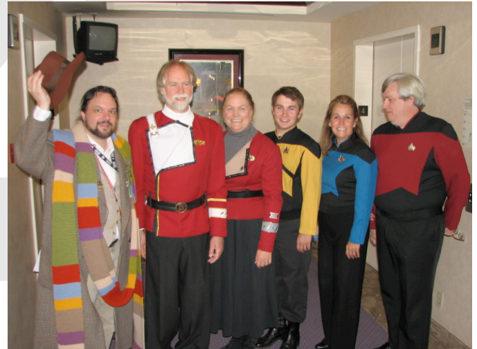
Fans leaving Babel Conference Ambassadorial Reception