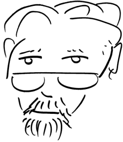
Figure 1 - Rob Cole

TRIVIA FOR CHOCOLATE! Thursday, August 24th, 2006, 5:30 PM - Room 210 C (ACC) CHANGE TIME from Thu 8/24 17:30 to Thu 8/24 16:00