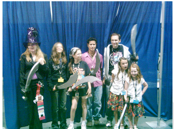
Figure 3 - Cutlass Pirates