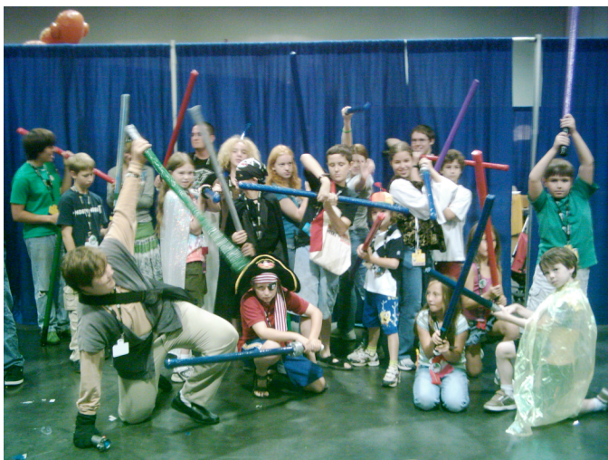
Figure 2 - Lightsaber Chaos